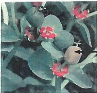
Multiple flowers per stem. Plants throw their seeds up to 15 feet.