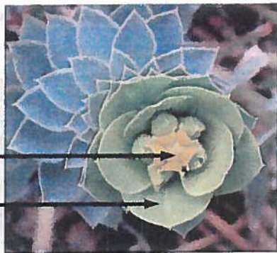
Yellow flowers with chartreuse bracts.