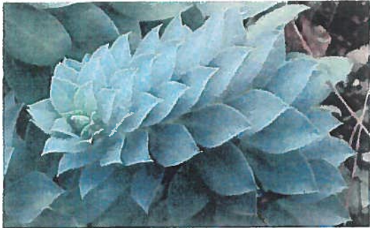
Blue-green leaves with a white milky sap.